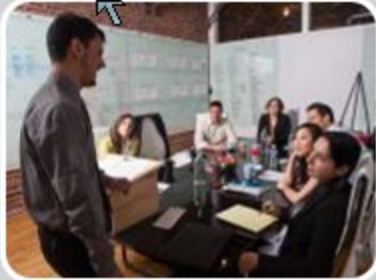
The Club Meeting