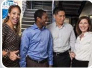
Outside the Club Meeting