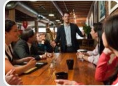
The Executive Committee