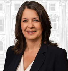
Honourable Danielle Smith, Premier of Alberta

A handwritten signature in black ink that reads "Danielle Smith".