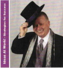
Ideas At Work! - Strategies for Success